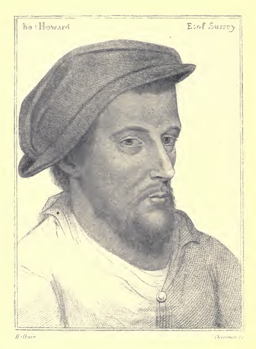
HENRY HOWARD, EARL OF SURREY